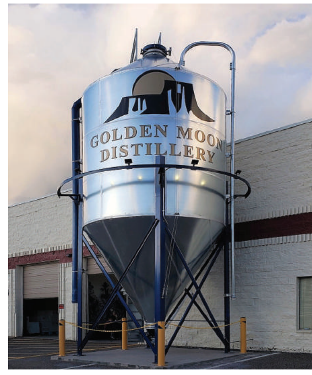
Malt storage at Maison de la Vie - home of Golden Moon Distillery

Colorado and set up a mere 2000 square foot space dedicated to small amounts of absinthe production. As Stephen tells me, it was a "hobby business". His primary source of income those days was his highly successful defence logistics consultancy.