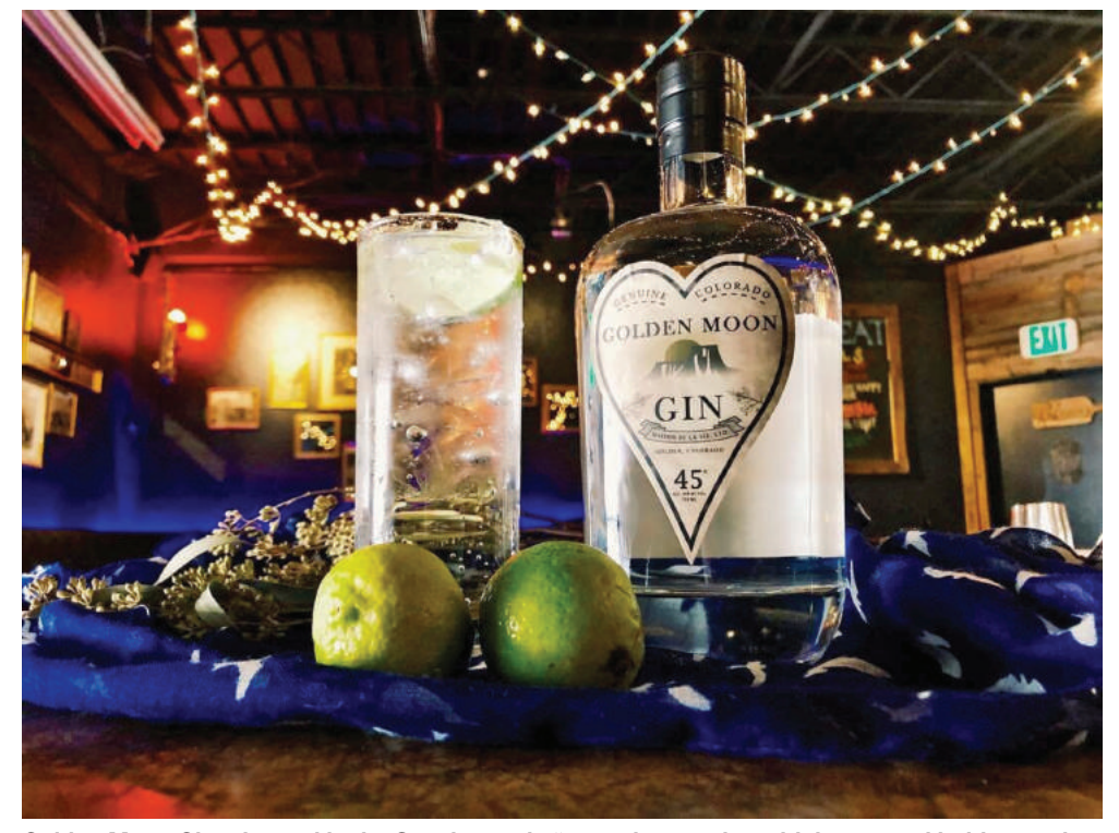
Golden Moon Gin, pictured in the Speakeasy, is "smooth enough to drink neat and bold enough to mix well with other spirits, making wonderful cocktails"